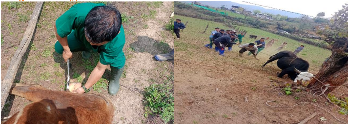
Figure 1: Bull Castration in the field

...Sterilize unproductive bulls towards enhanced dairy production by reducing the proliferation of undesirable breeds and promoting safer, more efficient breeding practices.